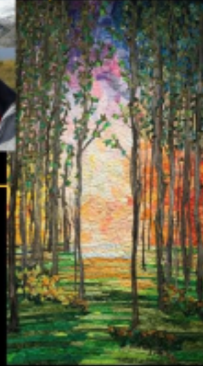
Into the Light 60" x 40" Quilted Wall Hanging